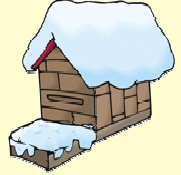
it can be snowy