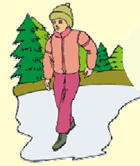
it may be icy