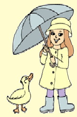
it can be showery