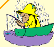
it's generally rainy