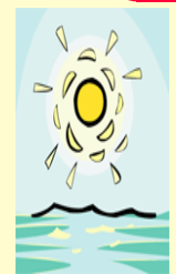
the weather is bright