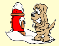
it's always cold