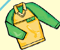
it's often cool