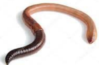
VER DE TERRE