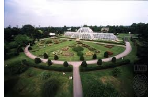
Royal Botanic Garden